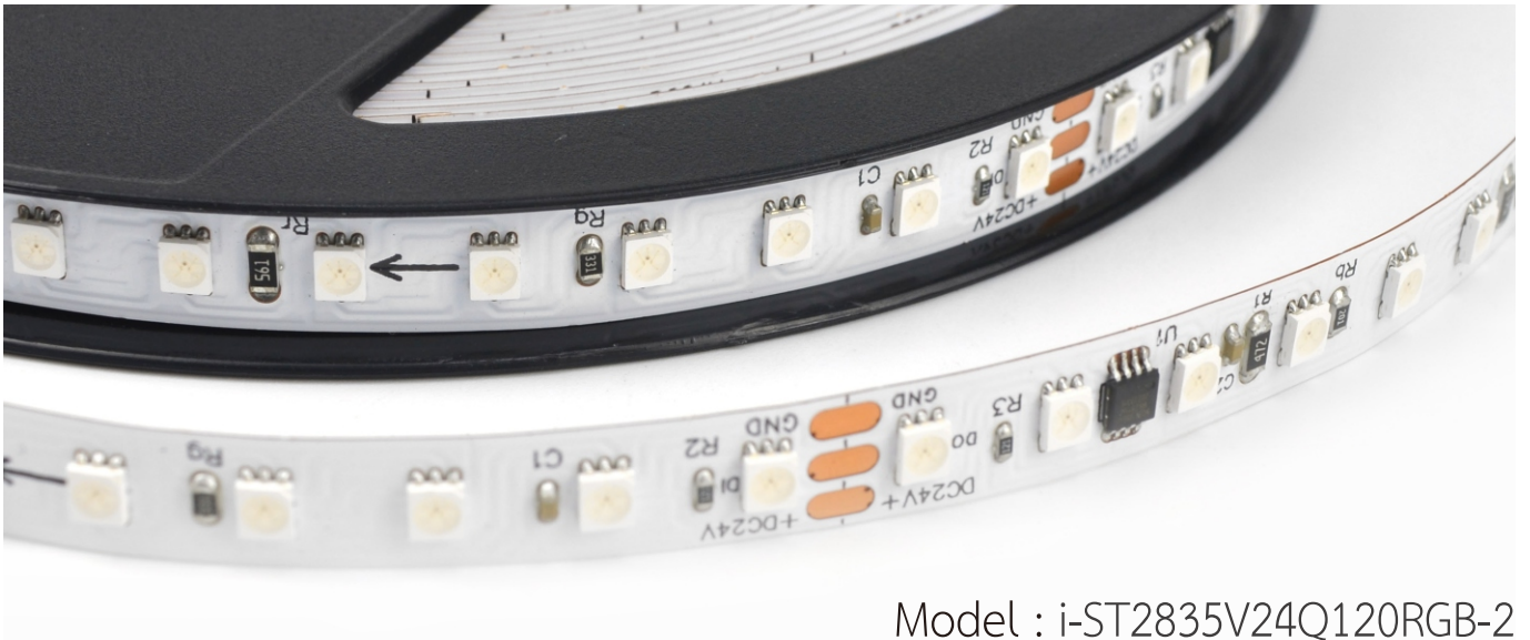
Model : i-ST2835V24Q120RGB-2