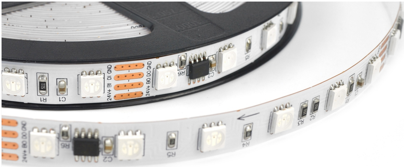
Model : i-ST5050V24Q60RGB-5