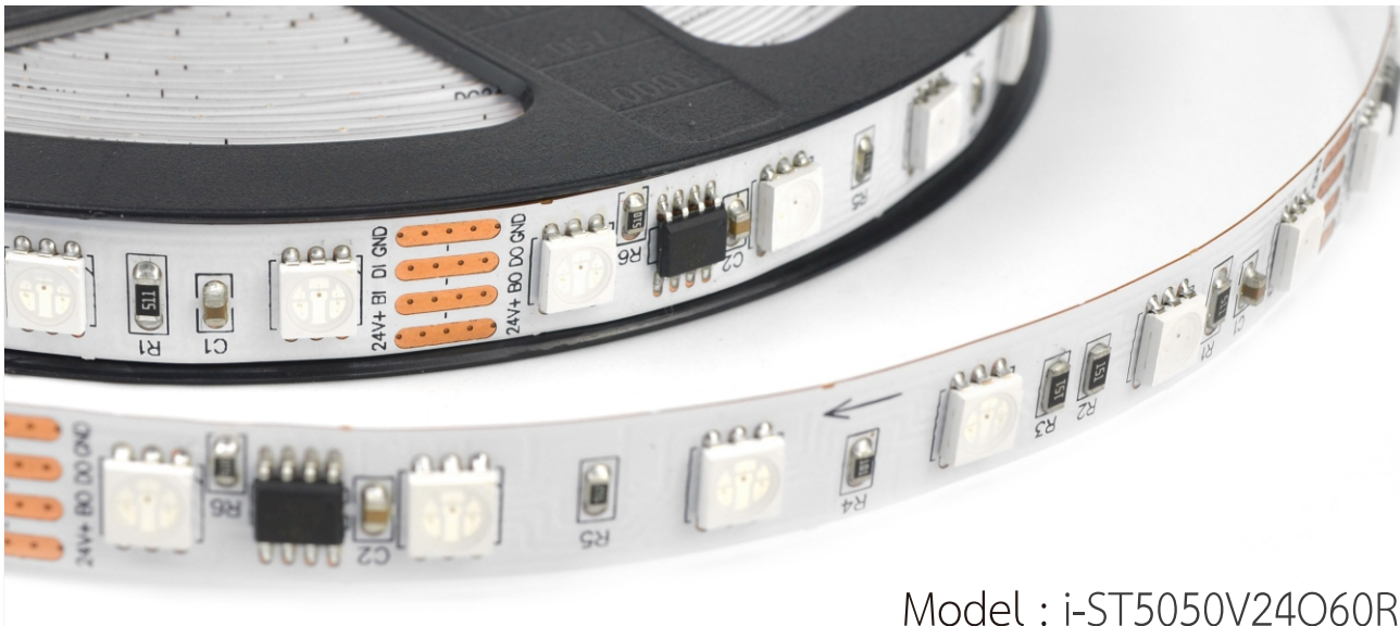
Model : i-ST5050V24Q60RGB-7