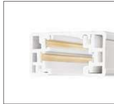
3 wires 1 phase