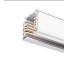
6 wires 3 phase (DALI)