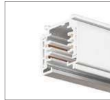
4 wires 3 phase 4 wires 2 phase 4 wires 1 phase (DALI)