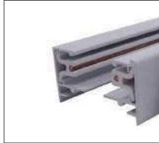
2 wires 1 phase