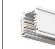
4 wires 3 phase 4 wires 2 phase 4 wires 1 phase (DALI)