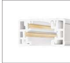
3 wires 1 phase