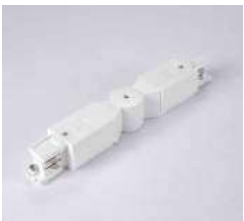
9.Adjustable L connector