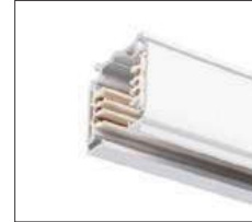
6 wires 3 phase (DALI)